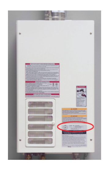
Brands recalled: Paloma, Rheem, Ruud, Rheem-Ruud and Richmond.

© Copyright 2007 www.tankless-recall.com | All Rights Reserved